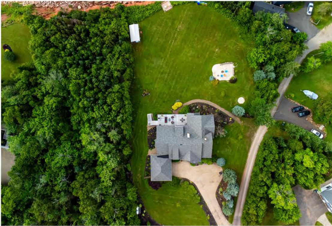
Lot Size Visibility